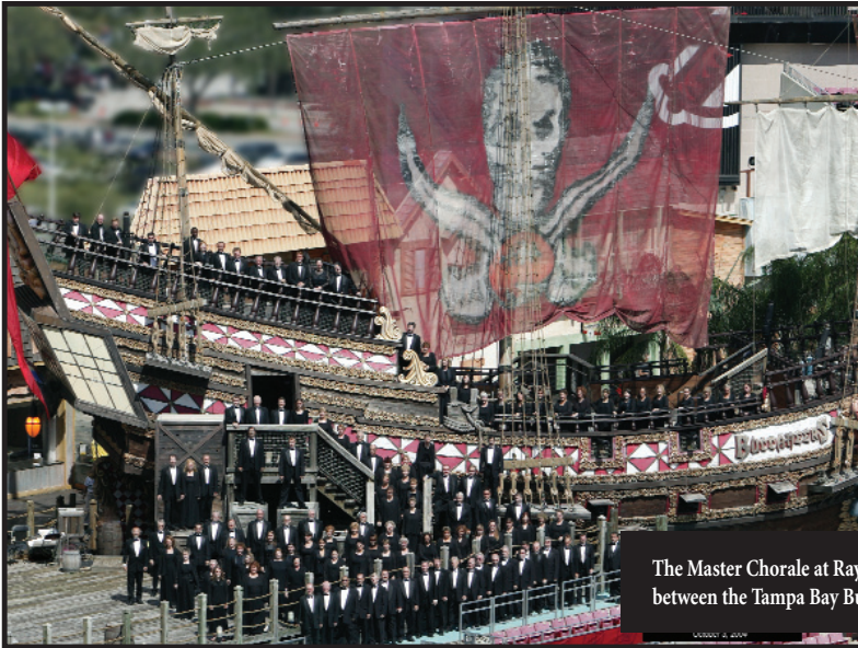
The Master Chorale at Raymond James Stadium. Last season, the Master Chorale kicked off the game between the Tampa Bay Buccaneers and Denver Broncos with a performance of the national anthem.